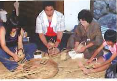
Straw work experience