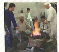
Ancient tatara iron-making experience