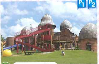
26 Kyu no Oka