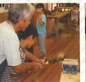
Wood/bamboo work class