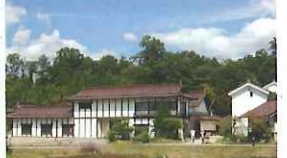
23 Upper farmhouse