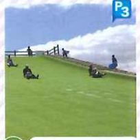
25 Slope for kids

The 80,000m 2 (8 ha) lawn park includes play facilities for day-long fun for the whole family! Enjoy downhill grass sledding!