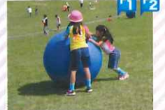
29 Big Ball