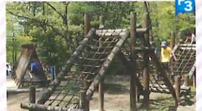
27 Forest Athletic Course