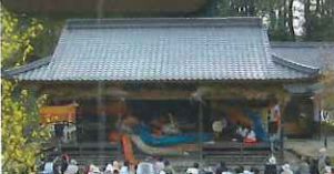
18 Kagura Hall, Sanshu Hall

Why not experience countryside life in nostalgic Satoyama in a leisurely manner?