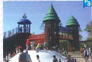
30 Fantasy adventure equipment: Kyu no Mori

Sports facilities and abundant nature in this active area for enjoyment of physical activities.