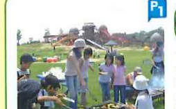
28 Oshibafu Hiroba barbecue corner