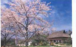
22 Lower farmhouse