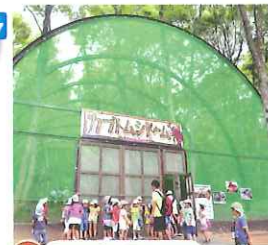
35 Beetle Dome *Open only in summer.

This area of the park preserves the natural environment full of abundant nature. Harmonize and learn about nature.