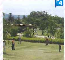
34 Ground golf course